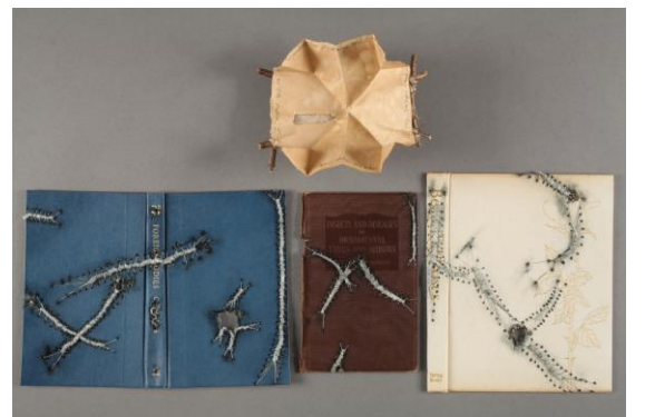
What is the native, 2014, wall installation

Repurposed book covers, pencil, waxed linen thread, kozo gampi torinokoshi paper, twigs, wool, leaf and insect matter, adhesives, fixative